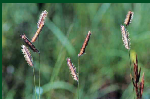
Blue Grama Grass