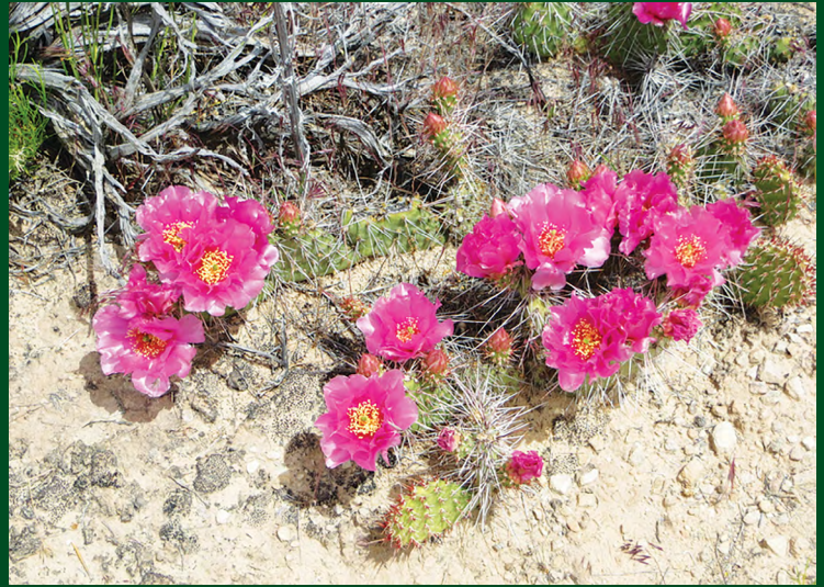
Opuntia

Colorado State University Extension is an equal opportunity provider. | Colorado State University Extension es un proveedor que ofrece igualdad de oportunidades.