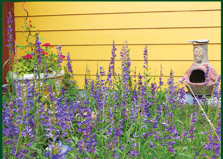
Rocky Mountain Penstemon