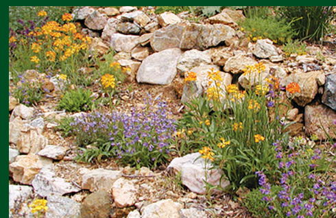
Wallflowers and Blue Mist Penstemons