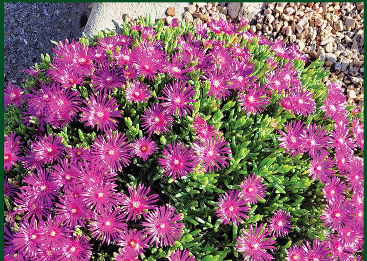
Purple Ice Plant