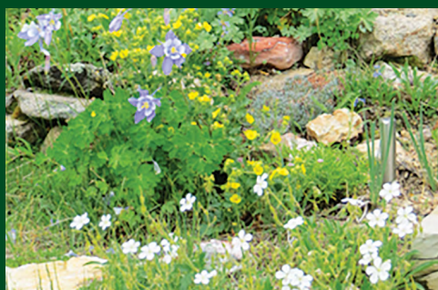
Geranium and Rocky Mountain Columbine